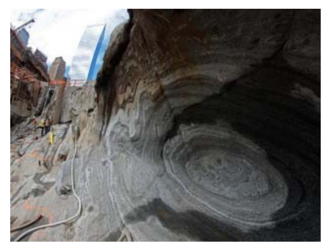
The 9-11 commission wa never interested in the molten pools of granite under the towers.

Despite the experts we had at VT, some with nuclear backgrounds, we additionally put the word out among our old boy networks that we needed confirmation that we were not being set up with an elaborate hoax by our many enemies. We get fed bogus stories weekly. Much to our surprise confirmation came in from the best sources that exist, from the IAEA nuclear inspector people and the bomb designers at Sandia who had written the report.