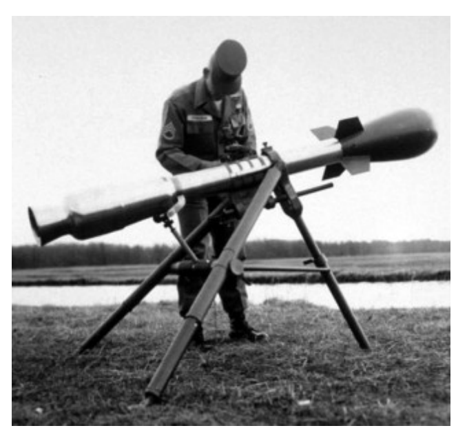
Mothballed Davy Crockett nukes went to Israel to use the warhead material in updated mini-nukes that were used in terror bombings